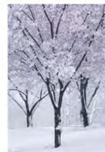
The Quiet Lilac Collection